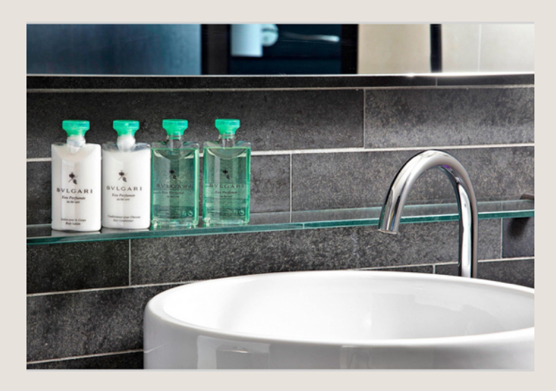
Bulgari - Green Tea

Eau Parfumée au The Vert is Bvlgari's very first Eau de Cologne for men and women.