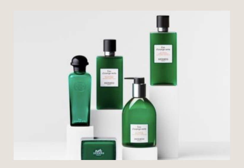
Hermes - Eau d'Orange Verte

Founding cologne created by Françoise Caron in 1979, and inspired by the smell of undergrowth wet with morning dew, this fragrance, which has since established itself as an emblem of Hermès, is distinguished by its singular freshness. A new fragrance imagined as an explosion of citrus notes, orange plays the main role between zest and leaves, lemon, mandarin, mint and blackcurrant bud. Eau d'orange verte reveals its complexity in a unique trail composed of oak moss and patchouli.