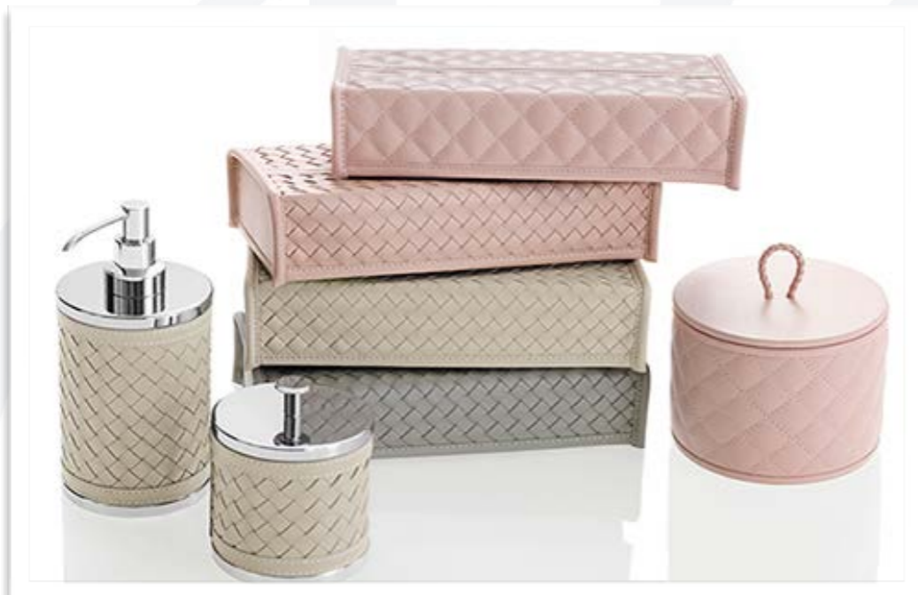
Riviere New Woven Accessories and Colours