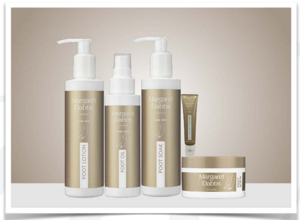
Vegan Friendly Pure Feet line