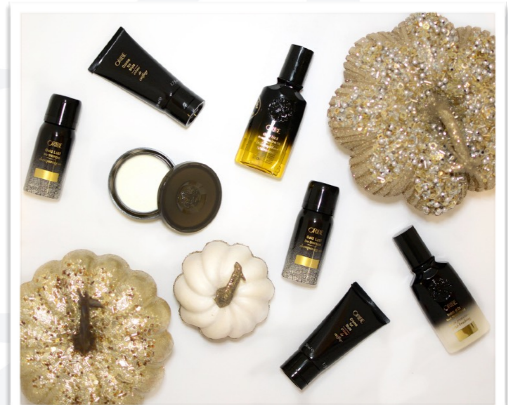
ORIBE Travel size hair products