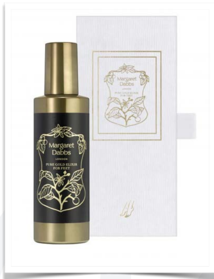
Pure Gold Elixir For Feet, 200ml