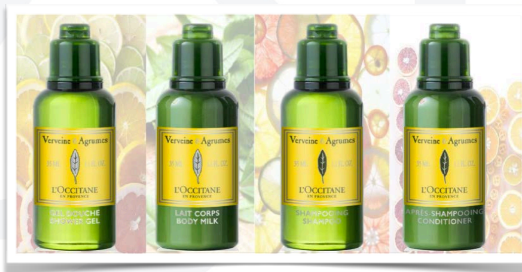
eco toiletries 35ml and 300ml