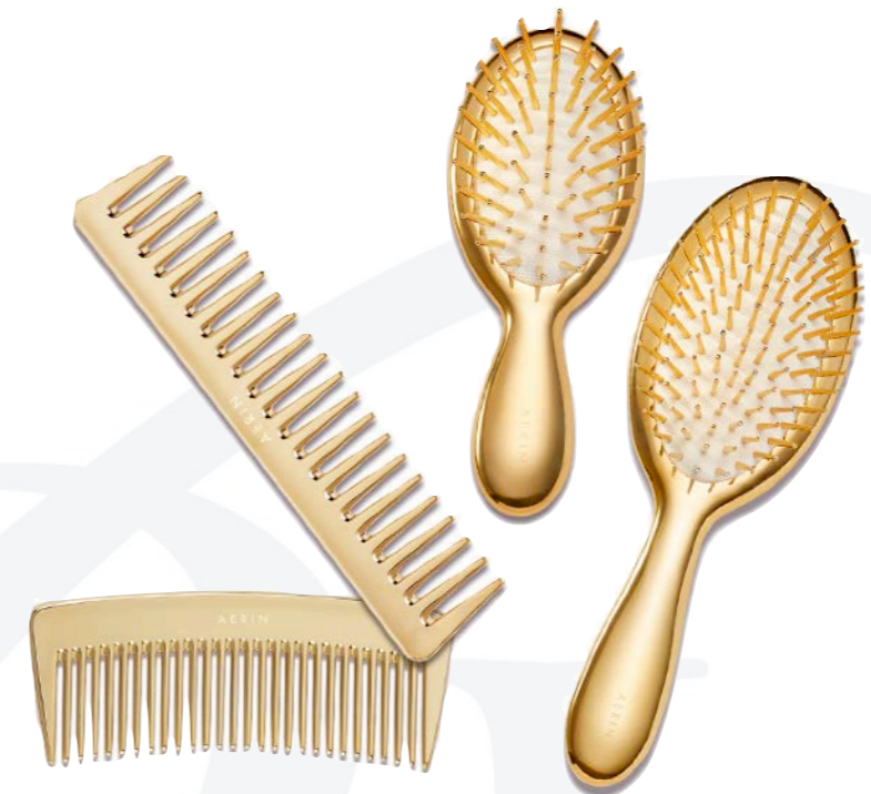
Aerin Gold Hair Accessories