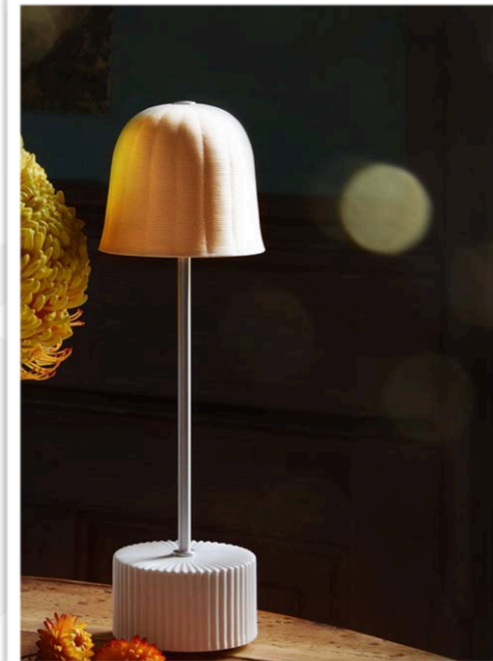
Campanule lamp available in different designs