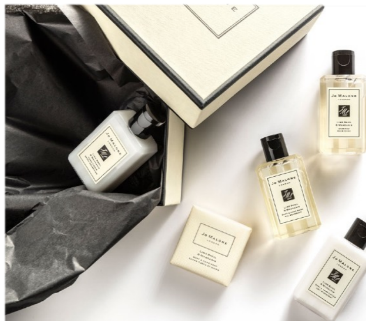
Jo Malone Guest Toiletries 75 ml